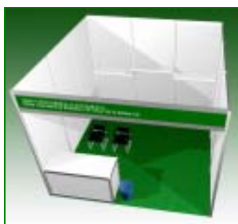
Basic Standard Package