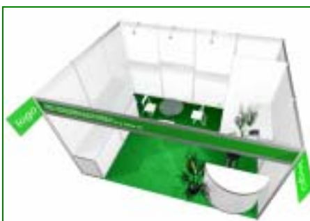
Luxury Standard Package